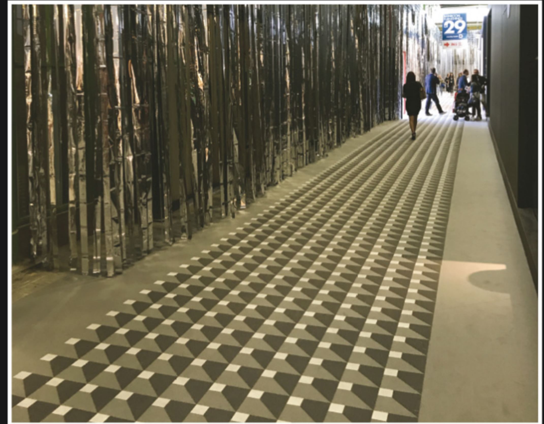
CERSAIE - BOLOGNA, ITALY