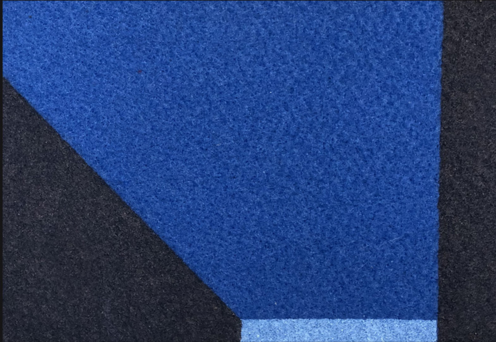
ELEA RUNNER DESIGN